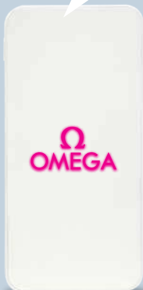
Light-Up Logo Multicolour