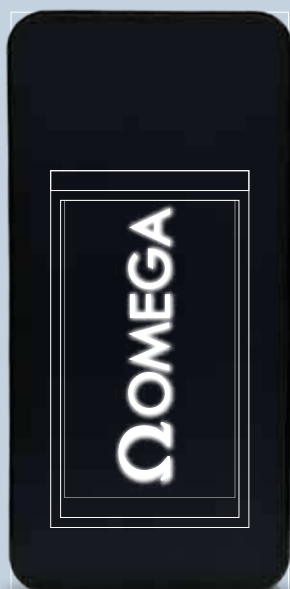
Light-Up Logo White